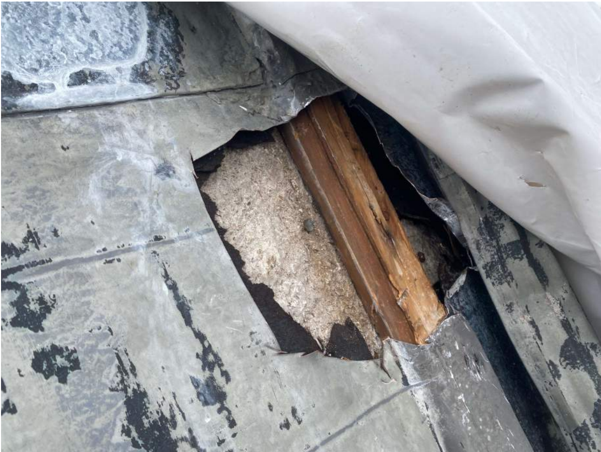
inspection opening at batten