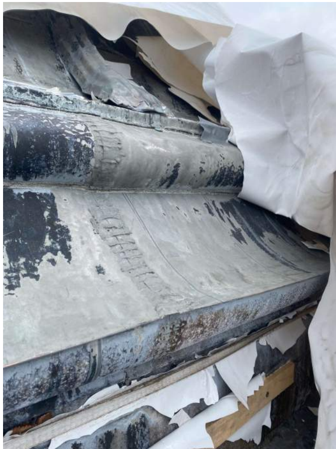
future built-in gutter location