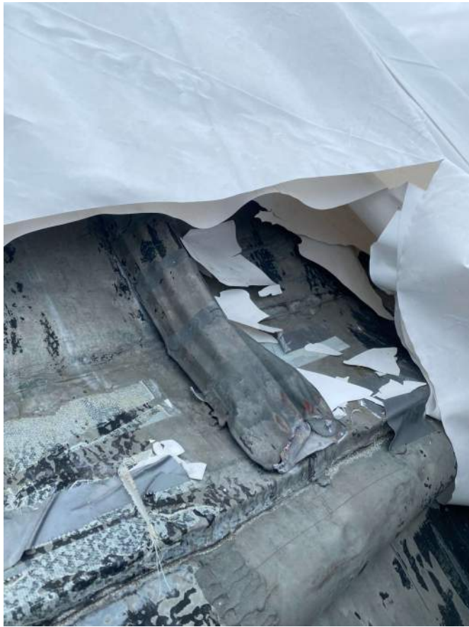
base of dome