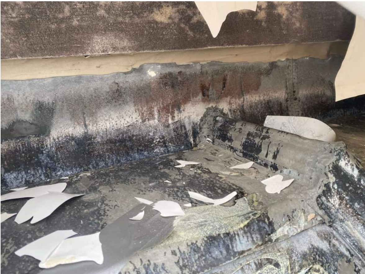
top of corner area