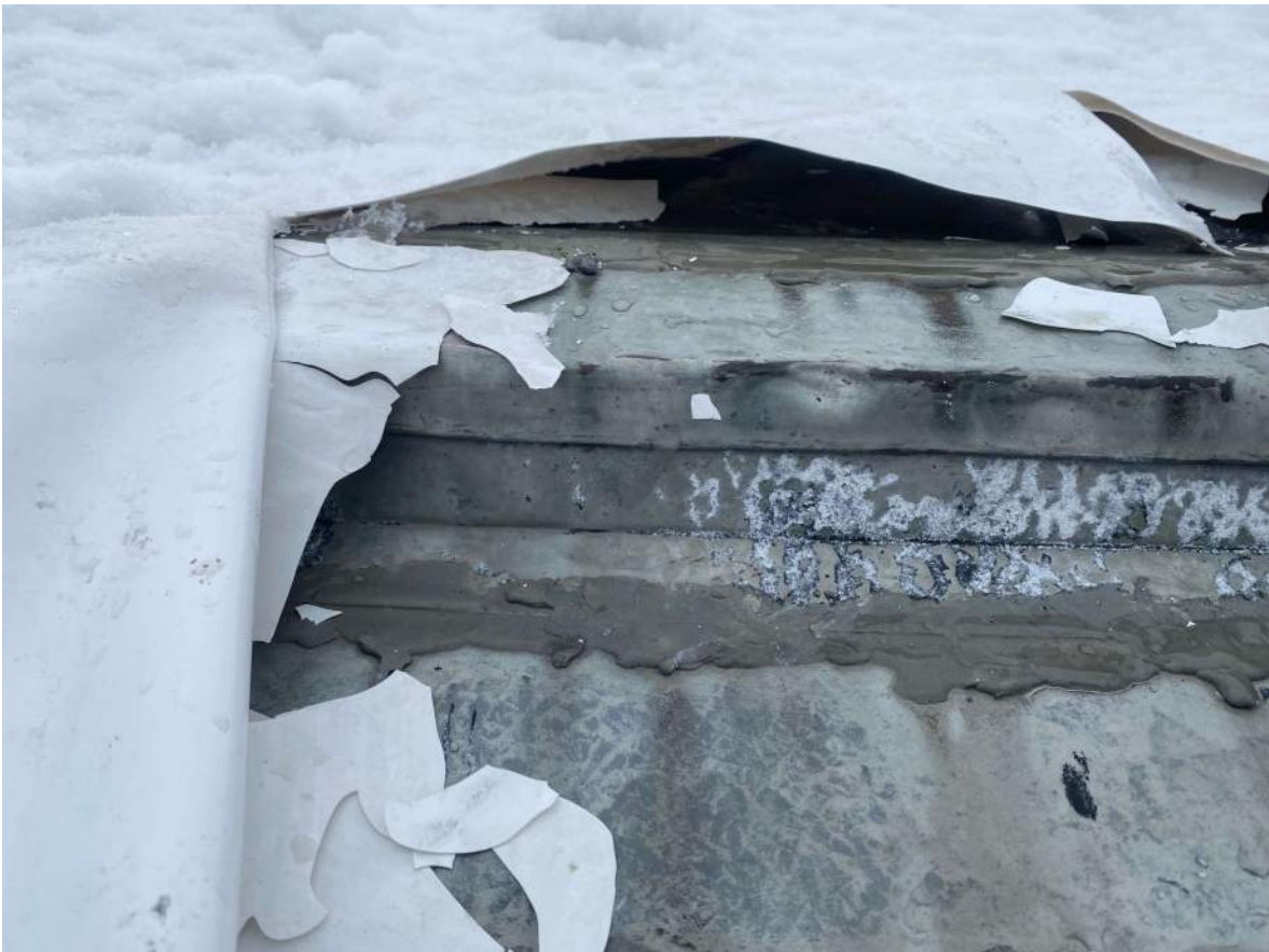
base of skylight