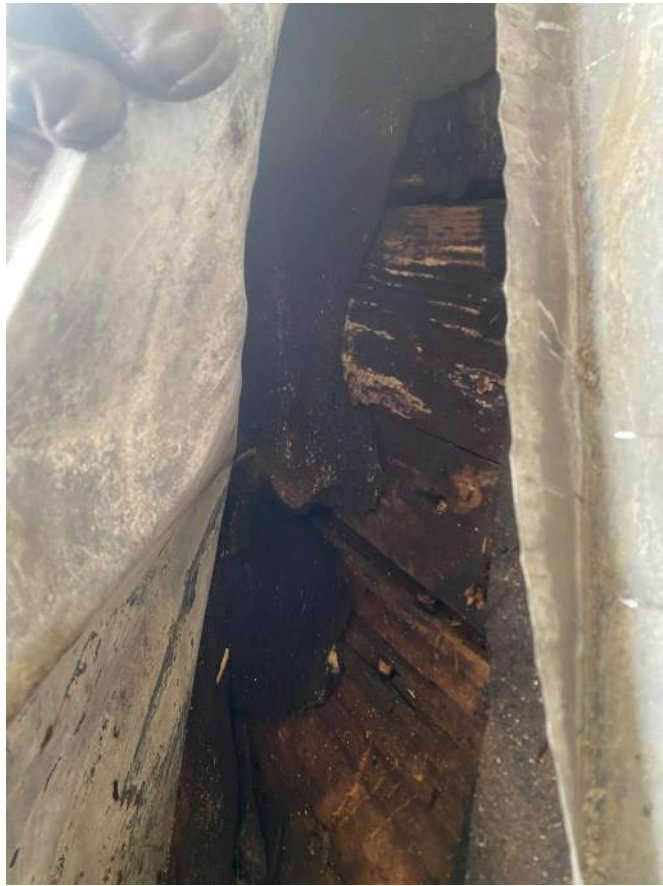
wood deck at corner area