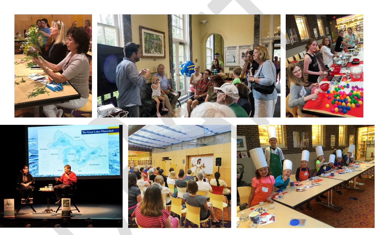
The Library is your connection to knowledge and discovery.

With its outstanding resources, services, and programs, the Library seeks to create a safe, inviting, and fully-accessible environment where users can seek accurate and balanced information to improve their skills, explore a new passion, and learn more about the world.