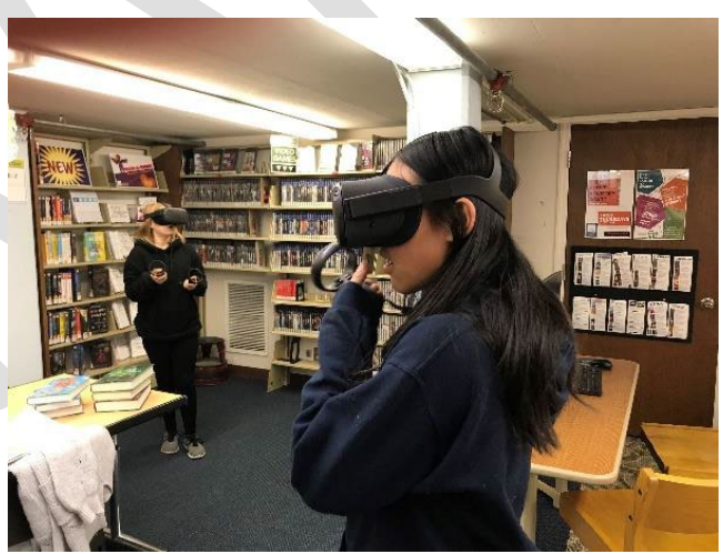
The Library is a hub for equitable access and education about emerging technologies.