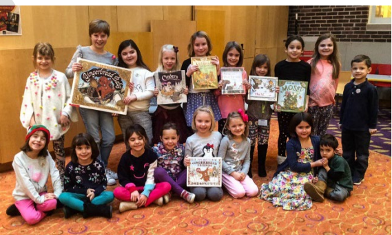
Library spaces and experiences designed and customized for all ages, interests, and needs.