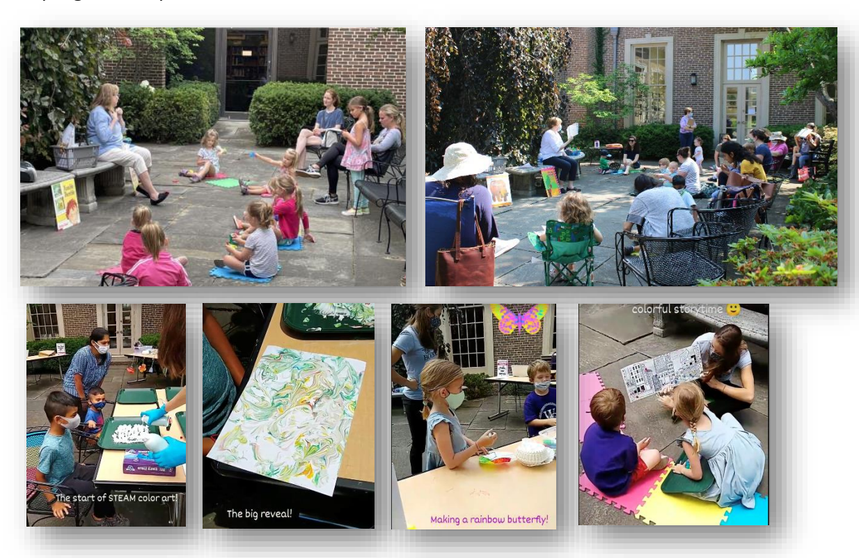
Summer Storytime and Family STEAM Lab in the courtyards.

The Library ability to offer on-site programming was limited due to the size of the Reed Room and the HVAC failure in the Kasian Room. One book group chose to meet in the courtyard and a number of STEAM and other storytimes for children were held in the courtyard and one event was held at the Forest Park Beach. There were also opportunities for families and small groups to tackle riddles and solve puzzles to solve the BreakoutEDU challenge boxes or complete a StoryWalk™ at the Library and other venues. The usual large summer reading programs such as the kick-off, magicians, music performers, and animal petting zoos did not occur due to the Kasian Room HVAC, and in some cases, the financial risk of losing deposits if the programs required cancellation due to COVID.